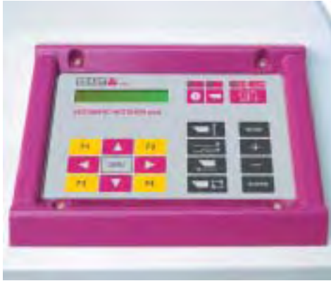
Soft-touch keypad to set up parameters