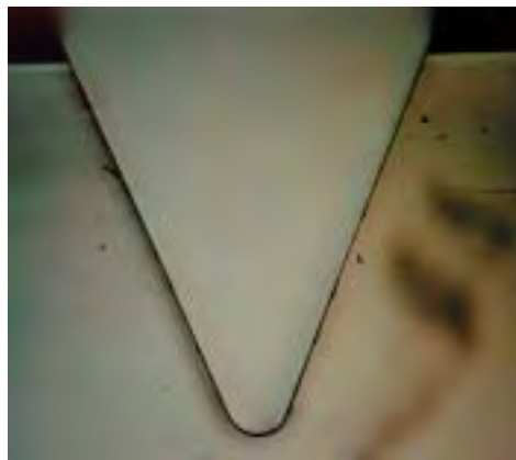
Detail of a notch obtained on ABS specimen using Automatic Notchvis. (The quality of the notch is evident)